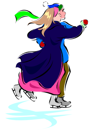
We will be skating right along...